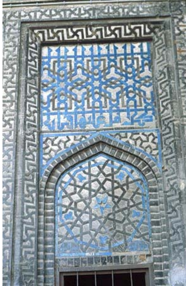
Figure 1. Typical Window of Yesil Madrasa - Bursa

are examined, it is observed that various Islamic cultural centres were the source of the development of Ottoman education. According to a statistical research made on this subject Iran was still in first place with 39.3 percent. Egypt was in second place with 30.3 percent. It is observed that Transoxiana, Iraq, Khorezm and Fergana each had 6.06 percent and that Anatolia and Khorasan had 3.03 percent. 12