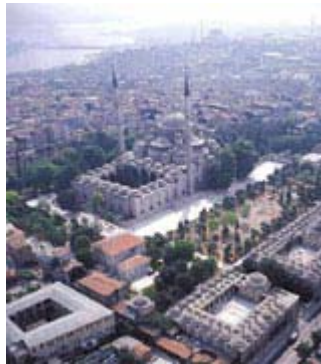
Figure 4. Arial View of the Fatih Mosque Complex and Sahn-i Semân Madrasas

In certain contemporary studies undertaken up until quite recently it has been argued that the Samâniye madrasas constructed under Mehmed II's orders resembled European universities and that Ali Kuscu, Vizier Mahmûd Pasha and Molla Hüsrev developed a curriculum for the Madrasa . However, the most recent research on the subject has attempted to correct this mistaken impression about the Fatih madrasas and their resemblance to a modern university and the claims put forth about their supposed curricula.