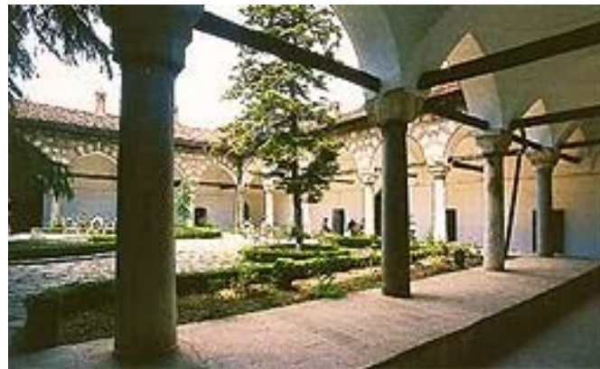
Figure 2. The Garden of Yesil Madrasa – Bursa

These statements are important in terms of bringing some clarity to the basic features of the traditional madrasa system prior to the Sahn-i Samân madrasas founded by Mehmed the Conqueror.