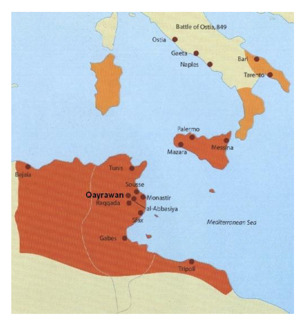
The Aghlabids 900CE (orange areas were only temporarily under Aghlabid rule)

420.^{40} Also, in the same mosque library, the same Abd al-Wahab states that it holds works such as Pliny's on botany which was translated from Latin. ^{41}