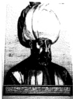
Figure 5. Portrait of Suleyman the Magnificent by Melchior Lorichs, Royal Library, Copenhagen.

Suleyman the Magnificent is one of the Ottoman rulers most frequently portrayed in Europe. Undoubtedly, this is because of the significant role he played in European politics throughout his reign for forty-six years. Suleyman's alliance with Francois I, who was defeated by the Habsburgs in 1526 and his Hungarian