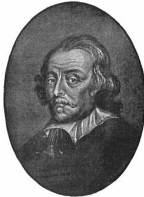
Figure 3. William Harvey. Portrait at the University of Texas in Austin, USA. Source:

However, he did not understand the physiology of the pulmonary circulation (dissipation of the carbon dioxide and replacement with oxygen) which was fully elucidated by Lavoisier in the 18 th century. 3