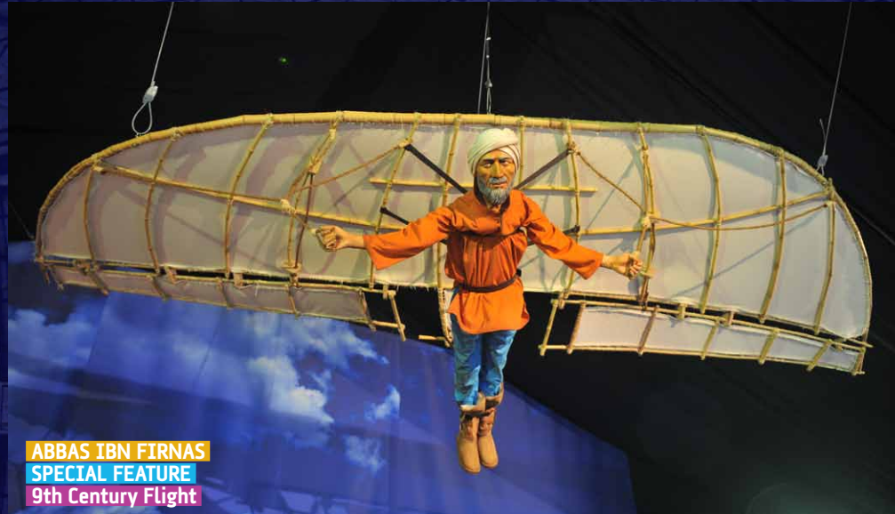
ABBAS IBN FIRNAS SPECIAL FEATURE 9th Century Flight

Discover how Andalusian physician Al-Zahrawi invented hundreds of surgical instruments and procedures more than a thousand years ago that are still saving lives in our modern hospitals. Experience the thrill of an Operating Theatre as medical geniuses of the past guide you through surgical procedures. Meet Lady Montague, who introduced the Muslim world's inoculation techniques to the West.